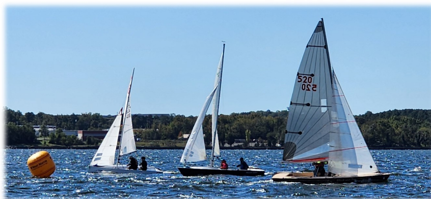
Smallboat Fall Invitational