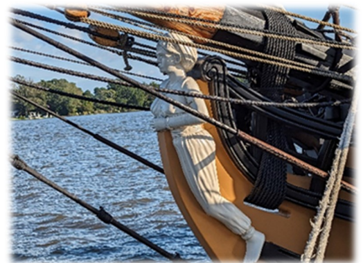
Sultana's 'Connie' Bow Sculpture