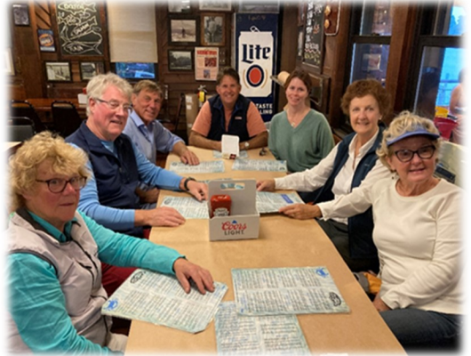
SMSA Cruisers on Good Behavior at 'Bad Alfred'

and made great time sailing the Southern part of the Chester River, then 'Reaching' under the Bay Bridge toward Whitehall Bay. Sailing in the same direction as the wind and current for a change, some saw speeds in excess of 7 knots sailing without the aid of the Iron Jenny. By navigating the 'Swaggle' (a new self-created nautical cruising name for navigating a tight zig zag bend in the shallows) entrance to Mill Creek, the cruising party anchored smartly with Happy Hour aboard Thisilldous , followed by dinner at Annapolis' world-famous Cantler's crab shack.