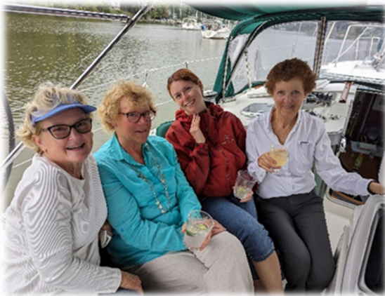
The Ladies Strike a Pose

Saturday 30 September included a cruise stopover at Hudson Creek, just off the Little Choptank River. With optimal Northerly winds while sailing South, Circe was seen on AIS flying down the Bay with her kite at over 9 kts in 15 knots of wind. Constellation and the rest mastered the art of 'wing on wing' and deep broad sailing. Hudson Creek, one of the author's favorite anchorages, is simply inspiring with plenty of anchor room and large home estates along a scenic coastline. Happy Hour started with awarding Les a 'Tallest Bottle on the Bottom Shelf' rum for achieving the longest single point of sail during the trip of over 91 minutes!