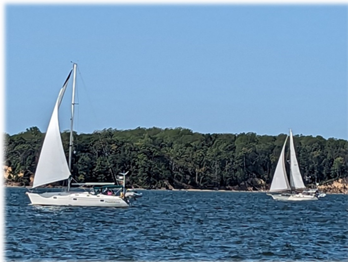
Thisildous and Cloud 9 arriving in Parade Formation off Drum Point

Sunday 1 October graced the SMSA cruisers with favorable winds and seas, enabling sailing the remaining distance across the Bay to Solomons in short order. Even though everyone left at different times, the sailboats themselves evidently negotiated a separate treatise as all four boats arrived together at Drum Point in an impromptu SMSA Parade of Sail, completing a fantastic 210 nm cruise!