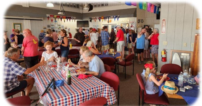
July 4th Potluck at the clubhouse