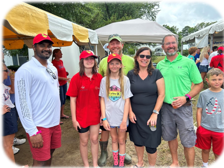
The crew of Pony Express

One last biggie!!!! Please send any High School students who love the outdoors our way....we will do our best to show them sailing is the way!