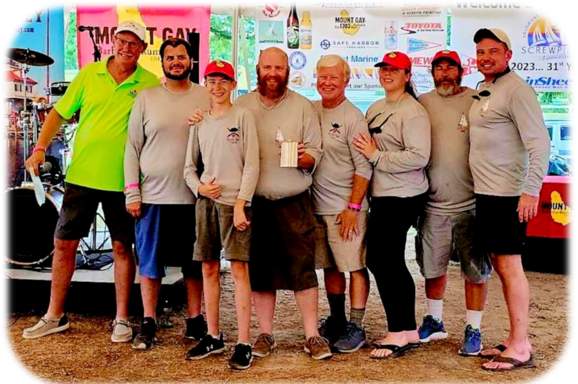
The crew of Barba Roja