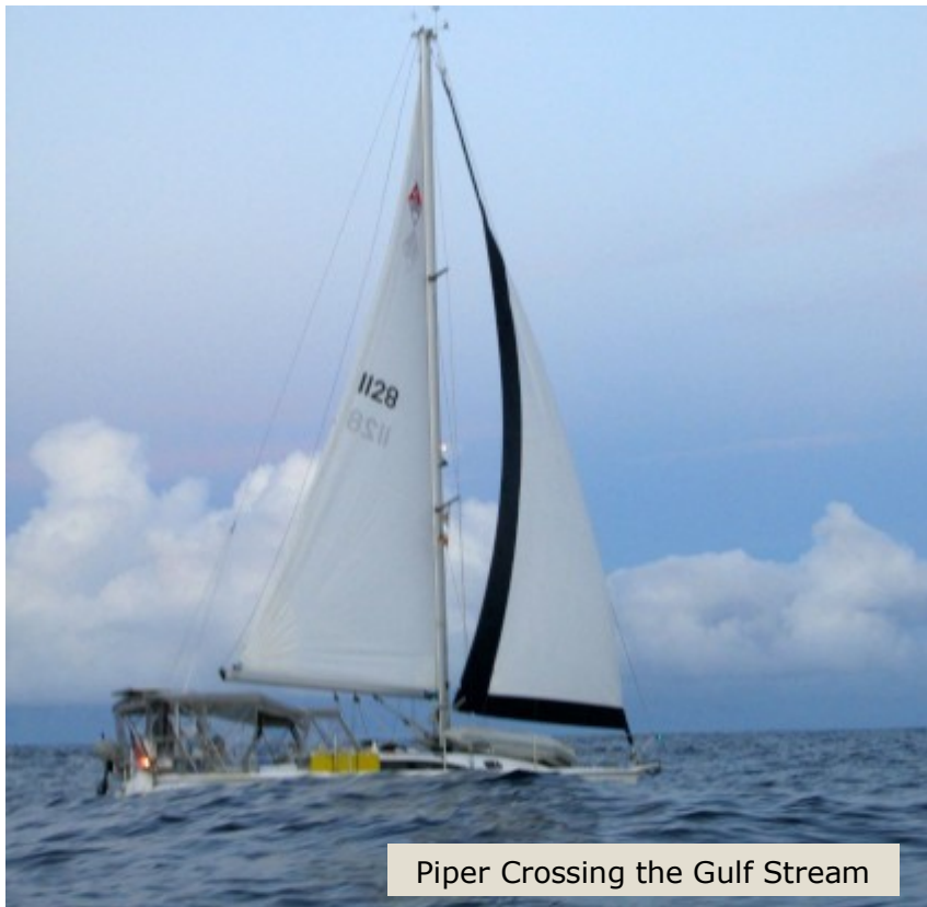
Piper Crossing the Gulf Stream