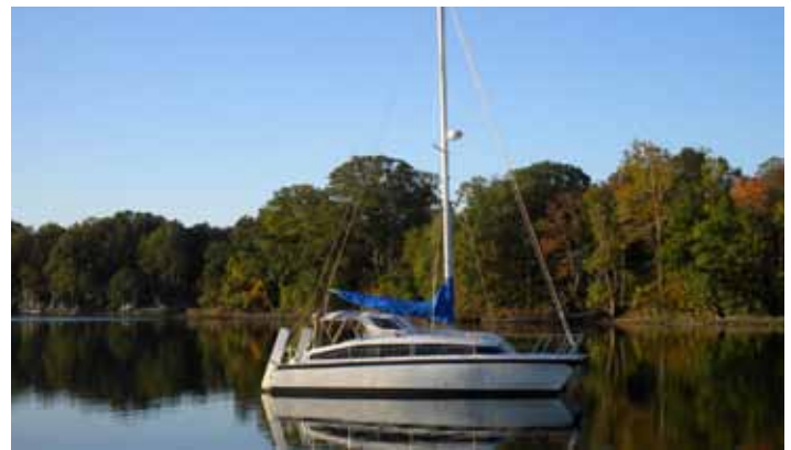
Serenity at anchor.

we could anchor and close to a spot we could dinghy our Chocolate Lab, Guinness, to take care of his