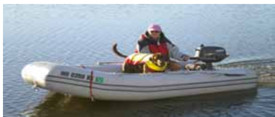
Guinness and Patty returning to Sandpiper II .

We headed into Rollins Cove and found a spot to drop the anchor. We set out our 35 pound CQR with about 100 feet of chain and settled in to watch. It didn't take long to notice we were dragging. Rollins Cove isn't known for its holding but this is the first we experienced a problem. The wind was steady about eighteen knots, or so. We weighed anchor and headed over to the lee side of the creek. We anchored in about ten feet of water just up the creek from Rollins Cove. We found a location