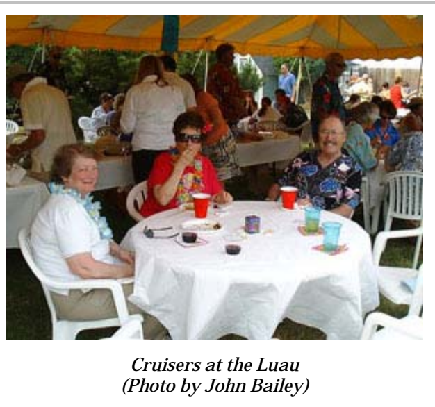
Cruisers at the Luau