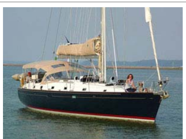
Moonlight Serenade enters Hudson Creek