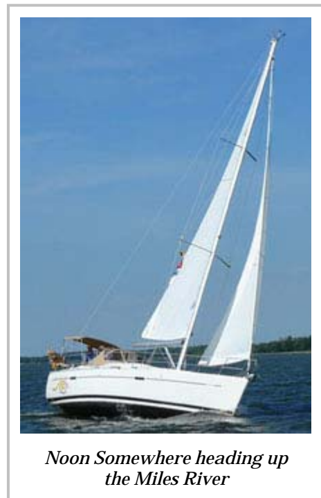
Noon Somewhere heading up the Miles River