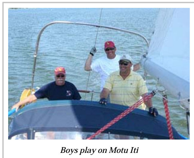
Boys play on Motu Iti

We enjoyed happy hour aboard Reflections with an assortment of food delights, then we enjoyed a fabulous dinner at Bay Hundred.