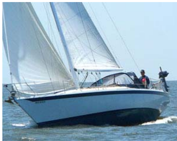
Sequoia chases Synergy

Skirting the southern (lee) shore approach to the Magothy close-hauled and with cross current dragging us south was a little bit of a chore, but having a laptop with chart plotting software allows for less worry and more accurate positioning. The depth sounder stayed above 7.5 feet and we sailed all the way to Sillery Bay #1 (a key navigational aid one of the trailing boats would later forget to honor as they hurried to the raft for happy hour..hi there, Rick!!) Today, Auspicious chose to be the anchor boat, and was soon joined by Noon Somewhere , Sequoia , Synergy , Motu Iti , later Reflections via kayaks, and even later still Moore Fun (Jeff & Donna Moore), having come up from Solomons with co-captain Hobie on. We enjoyed happy hour aboard Auspicious and feasted on cheese, crackers, fancy deli meats and Patty's zesty salsa.