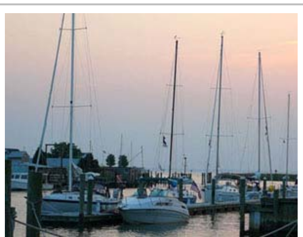
Sunset at Knapps Narrows