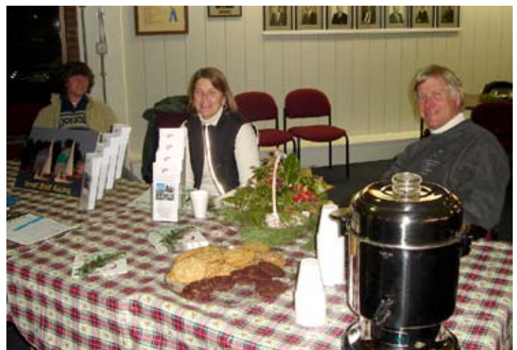
Prospective new members welcome table providing information on club programs and benefits