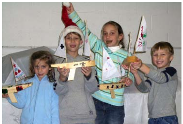
Next generation sailors show off their newly-built small wooden boats prior prior to launch on the pond