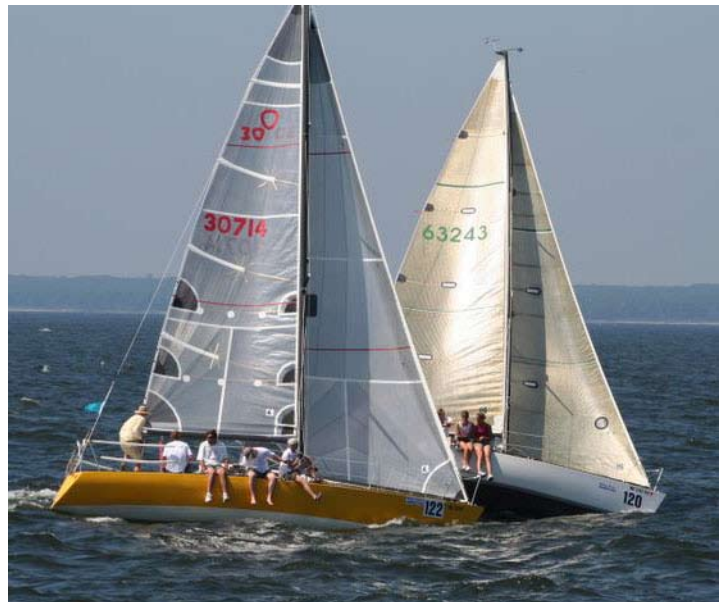
Riddler (1st. in Class 4, PHRF 5) passing Yell-O-Tail