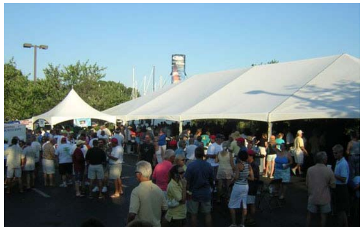
Everyone enjoying themselves in and around the tents that featured refreshments and entertainment.