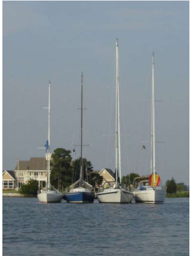
Little Latitudes, Synergy, Sequoia and Noon Somewhere rafted in Town Creek, Oxford.

Sails in, motor on, secure below and dodger/bimini connector in. Three sailboats were around us, one blue boat behind and headed north and two headed south. Joe, and his lovely bride Tracy, were enjoying all the excitement during the preparation and then the storm hit. It was a wall of wind. As the storm closed in you could just see the water churning like it was in a very high-powered industrial washing machine.