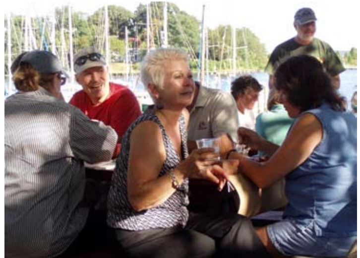
Your author enjoys good wine, great friends and the absolute best weather for weeks.