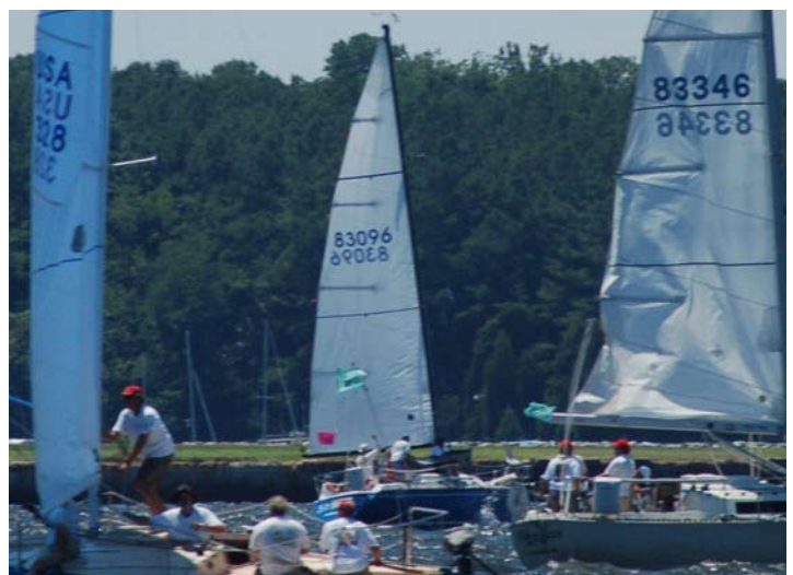
Synergy (2nd. in Class 10, PHRF 8) sail number "83096"