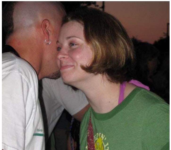
Lots of great social interaction.