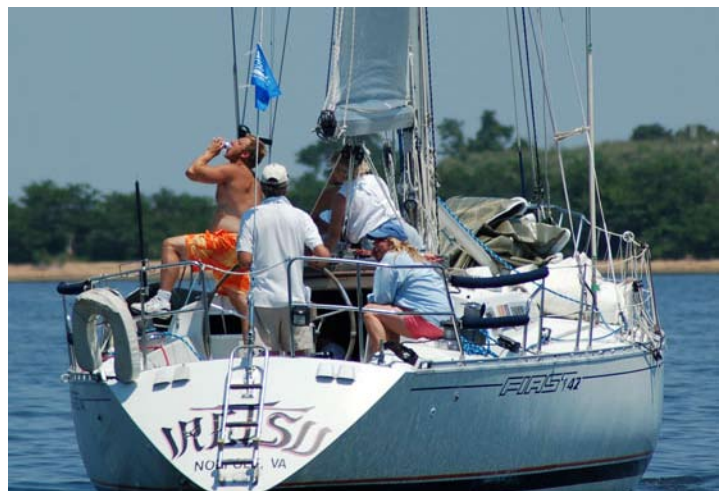
Iretsu (2nd. in Class 12, NS PHRF)