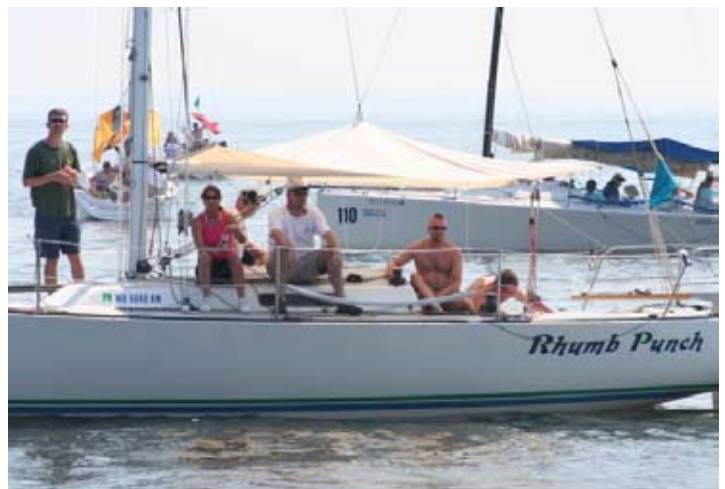
Rhumb Punch (3rd.. in Class 4, PHRF 5) taking in the shade