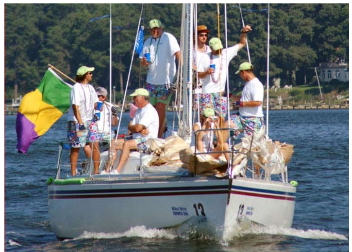
Kugerrand (2nd. in Class 12, NS PHRF)