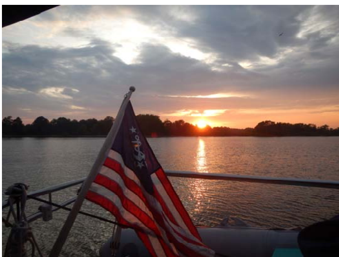
Great Wicomico Sunset