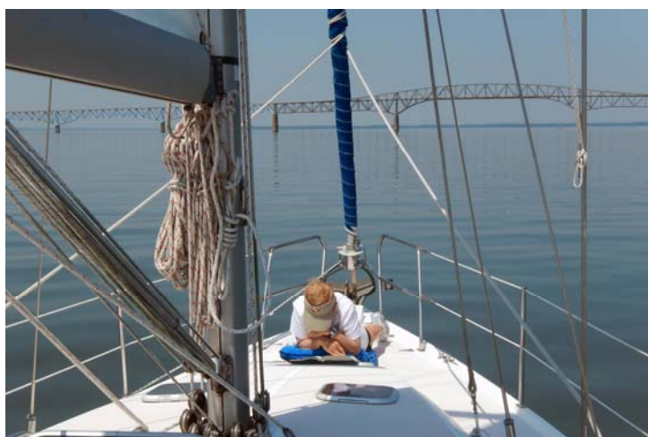
Lazy Motoring Up the Rappahannock