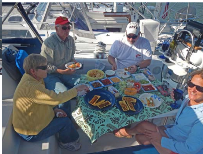
Happy Hour Begins!

Ruste Nayle (Rod & Pat Schroeder), Piper (Jerry Taylor), and Patty K (Rich Freeman & Patty Kimmel) participated in the week long Cruise South from 12 – 18 May. The original cruise plan had us staging in and out of Onancock to go up river to Pocomoke City for a different sort of adventure; however, upon closer review of the river route, a cable crossing with 57' vertical clearance was deemed to be too low to assure safe passage for some of our boats. Our modified cruise route had us departing a couple of days later, skipping Onancock/Pocomoke, and staying on the western shore of the bay to sample anchorages in the Great Wicomico River, Corrotoman River, Carter Creek, and two nights in a slip at bucolic Urbanna which was gearing up for their version of a holiday weekend as the "Cocktail Boats" were coming to town for an annual race event. We departed Solomons with a strong southerly wind blowing up the bay, so our under-sail travel was limited to the short legs in and out of the rivers/anchorages. Rich and Patty spent a couple of