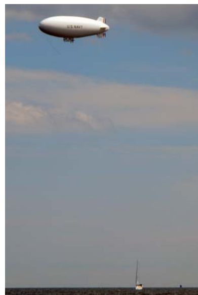
Blimp Checks out Patty K