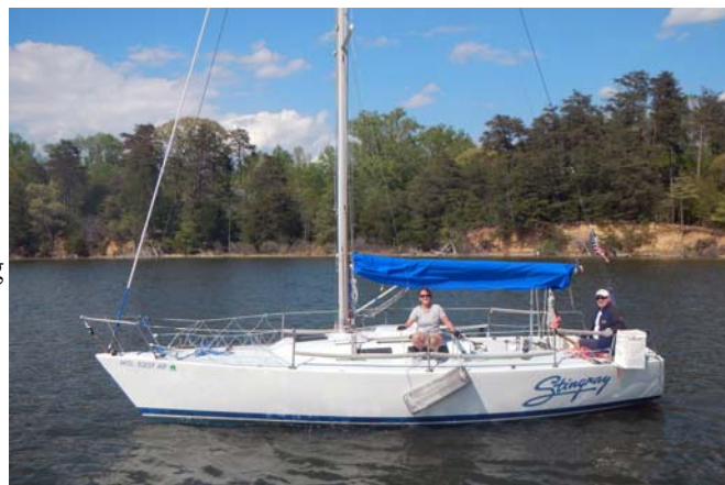
Stingray Joining the Raft