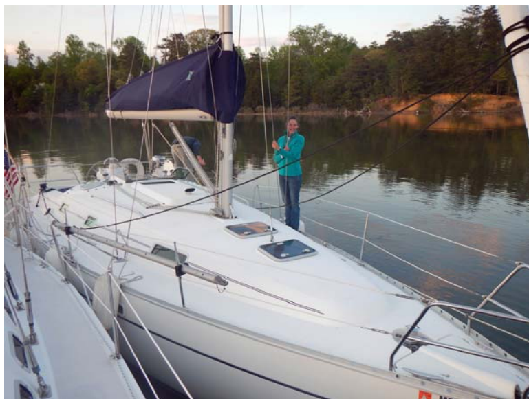
Blue Star Rafting Up