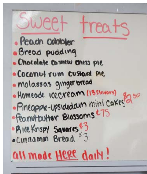
Dessert List at Something Special