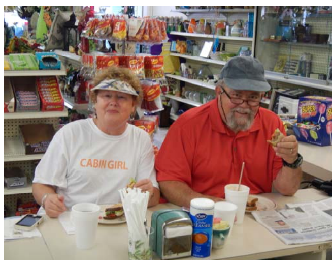
Urbanna's Old-Fashioned Soda Fountain