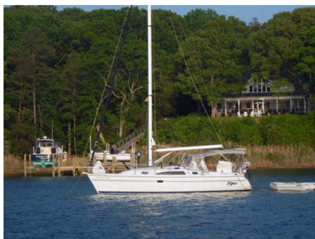
Piper in the Corrotoman