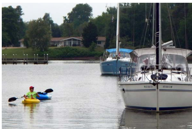
Water Toys to Share