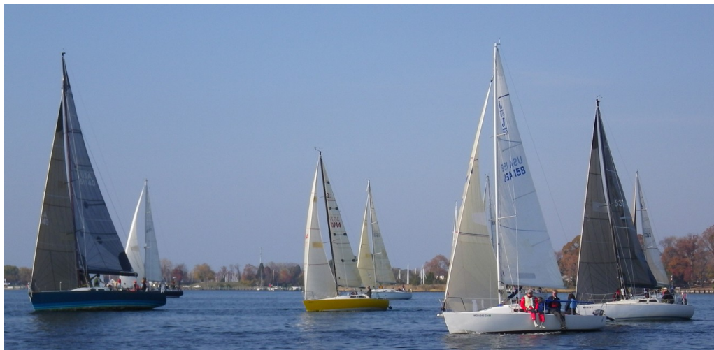
Fall Frostbiting—November 21, 2010.

The gist of the SI modifications: river mark informal series such as the Wednesday night series will only require 6P configuration. Frostbites and mouth of the river invitational and series races will require 5P configuration. Only our middle distance races require full 4P configuration. We hope this helps increase participation in our shorter informal programs and that participation and camaraderie get more boats out to consider participation in our formal and longer racing events.