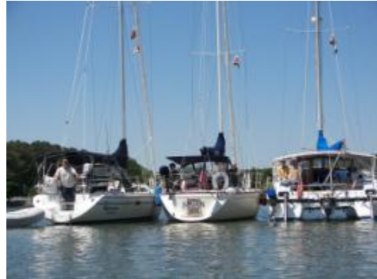
Raft in mill creek

May 18 Departed Annapolis/ Wye River Monday: Noon Somewhere, Sequoia, Twice Around, Walkabout