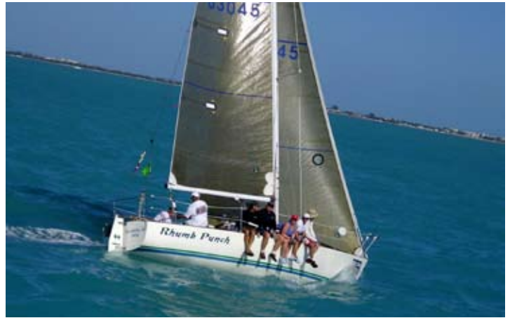
Rhumb Punch in the process of winning yet another race

We have lamented for years that we rarely get any other clubs' racers to participate in our SMSA-hosted CBYRA races. Well, this year Herrington Harbor Sailing Association is going to send 6 to 10 boats to race in our Fall Invitational in Octo-