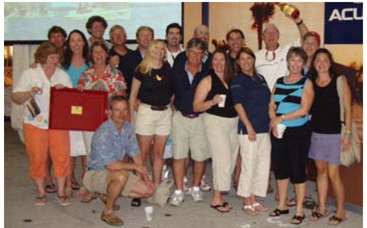
Rhumb Punch crew and other SMSA members at Key West